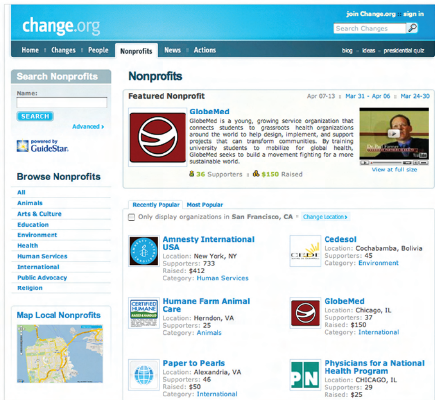
Change.org receives GuideStar data via Web service module.

Packaged as a Web service, GuideStar Charity Check marries critical IRS information on tax-exempt organizations into a streamlined solution to help users determine charitable and supporting organization status and thus comply with federal regulations. Via a dynamic call to the GuideStar database, the module allows high-volume grants administrators to retrieve dynamically a comprehensive set of data fields that are critical to thorough pre-grant due diligence. The XML data feed then returns Charity Check report fields to the grantor for integration with client-side applications or as stand-alone documentation for pre-grant due diligence. For auditing purposes, an easy-to-read date- and time-stamped report verifies charitable and supporting organization status.